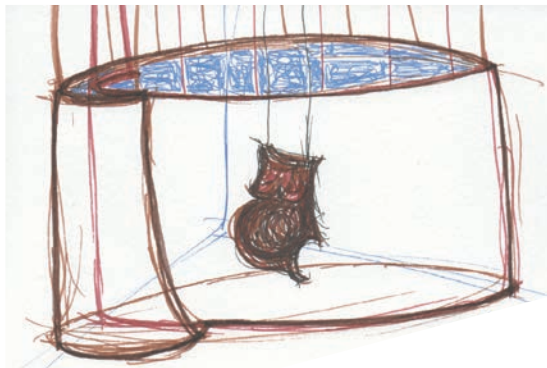
Installation: side view