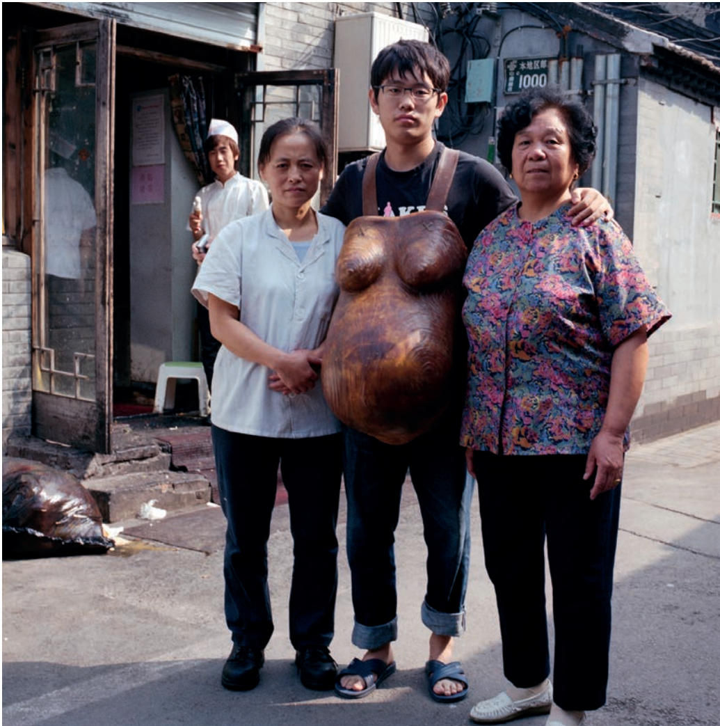
3 Generations, Beijing, 2011

It was hard performing in China, with only a piece of paper with written sentences.