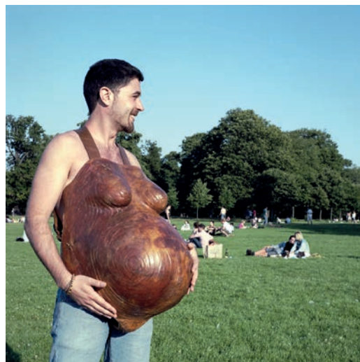
Diptyc. Hyde Park, London, 2012