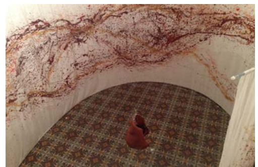
Installation: inside view